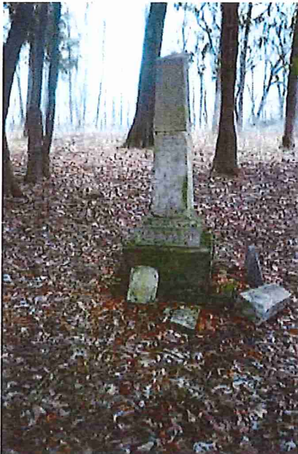
A collection of headstones and monument pieces that typify conditions found throughout the cemetery.