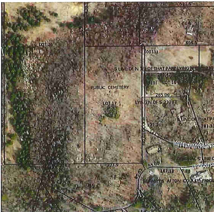
Aerial photograph of Mount Hope Cemetery on Upper 34 th Street South at the top of the tallest bluff edge overlooking the St. Croix River Valley. The only higher point is on Bissell Mound that is located further to the west on the prairie.