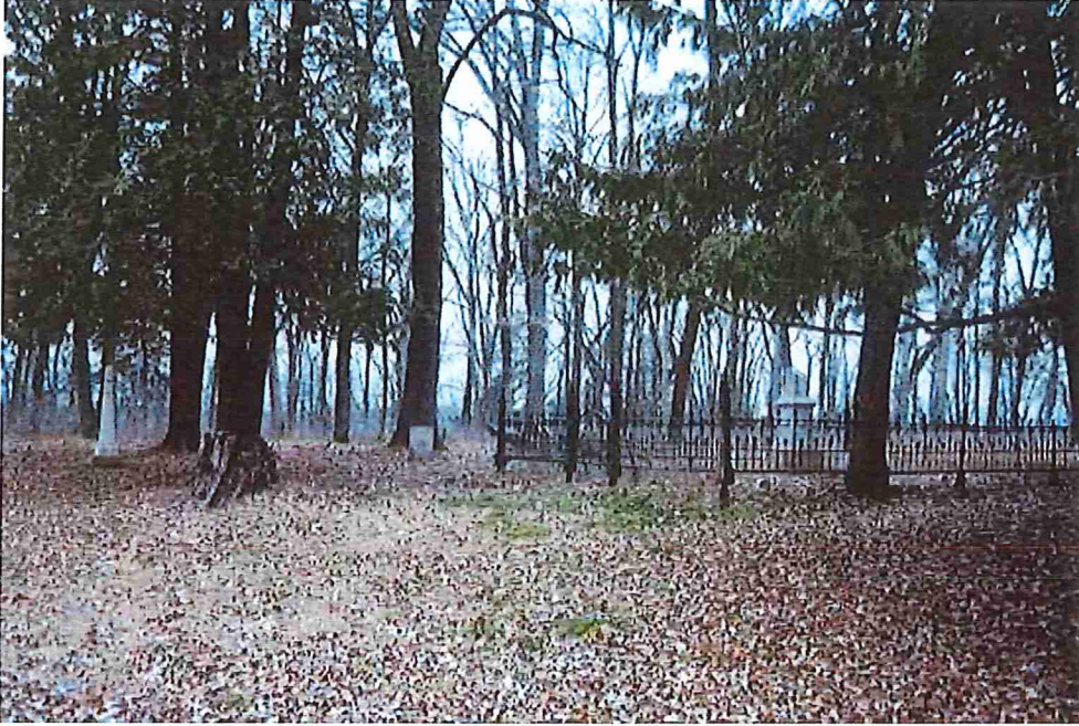
The broken Berry Family monument to the right sits at a gravesite defined by a short iron fence and gate.