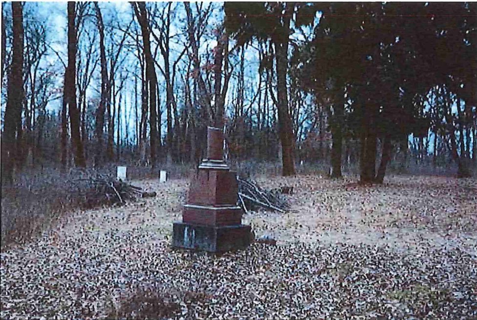
Most of the formal monuments in Mount Hope have suffered damage through vandalism. This photograph is looking southwest over the cemetery's somewhat wild grounds.