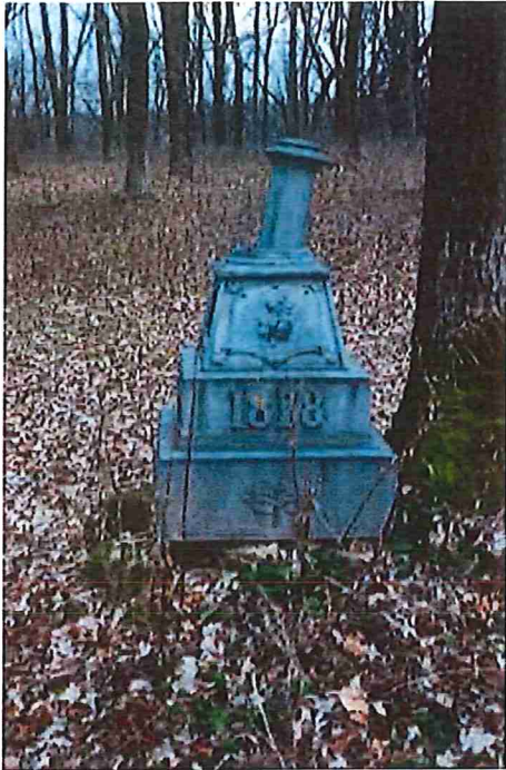
A "white bronze" spelter grave marker for Civil War Veteran Charles Cushing.