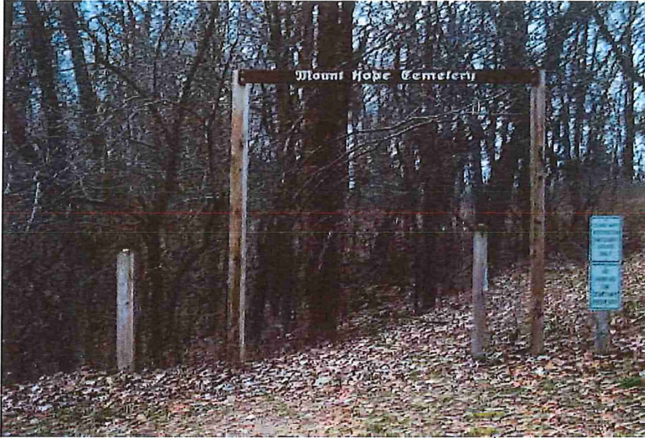
The entry sign to Mount Hope Cemetery at the top curve of Upper 34 th Street South.