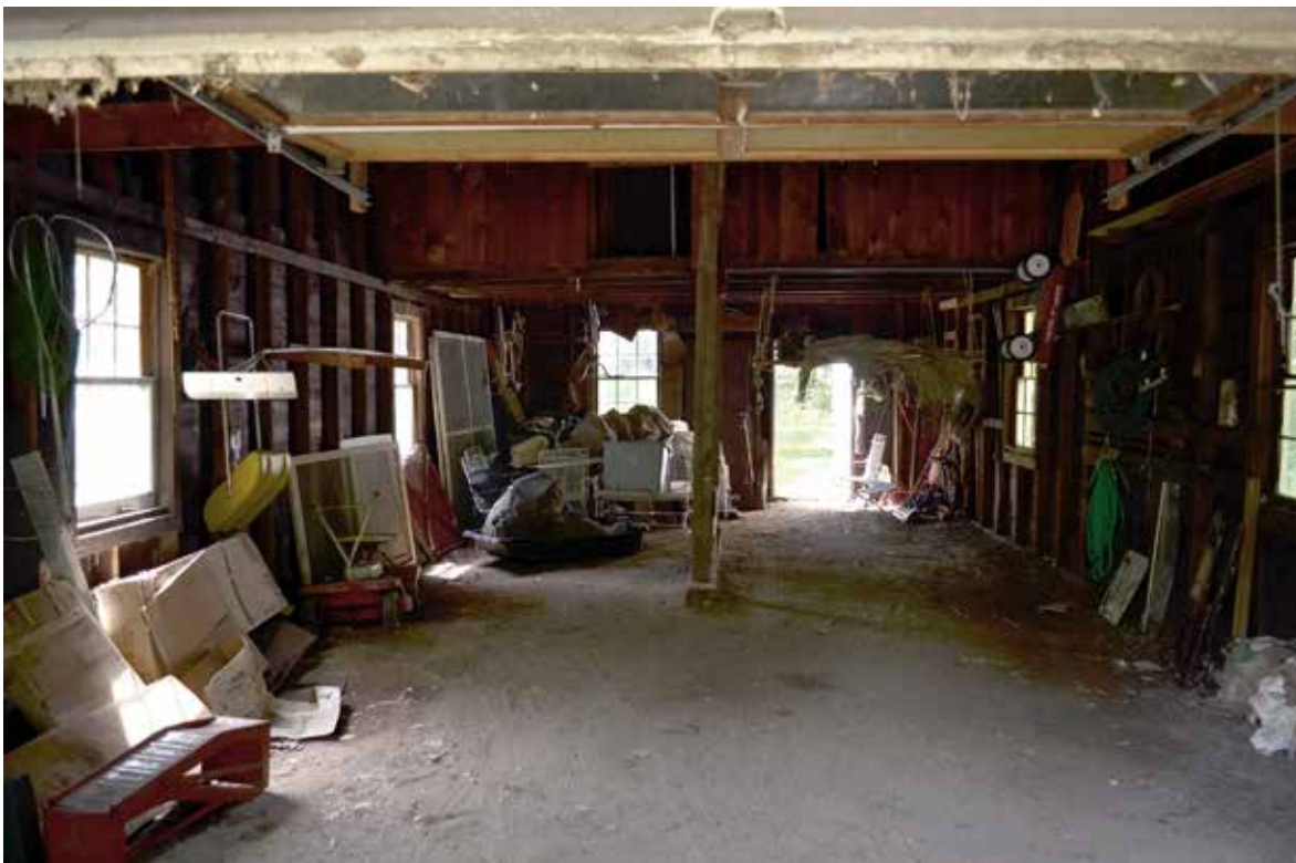
Shop interior looking west from the front opening along St. Croix Trail South.