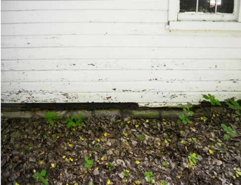
Traces of the shop's limestone foundation can be found toward the northeast corner of the north-facing elevation. Most of the remaining foundation has sunk, along with the building into the soft, wet soil next to the creek.