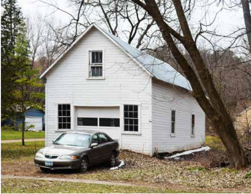
View of the main, east-facing elevation with the modern overhead garage door down. The north-facing elevation retains its six-over-six double-hung window configuration. Camera facing southwest from St. Croix Trail South.