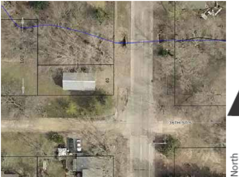
Aerial photograph of the Emil Asp Blacksmith Shop at the northwest corner of St. Croix Trail South and 36 th Street South.