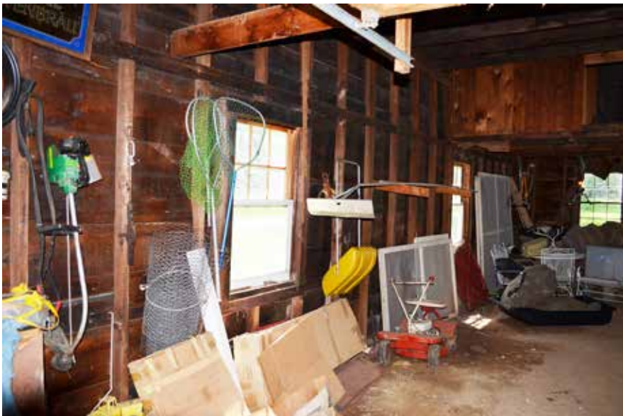
This interior view looking to the west southwest displays one of the two double-hung windows, both of which have lost their divided lights and are now six-over-one in configuration.