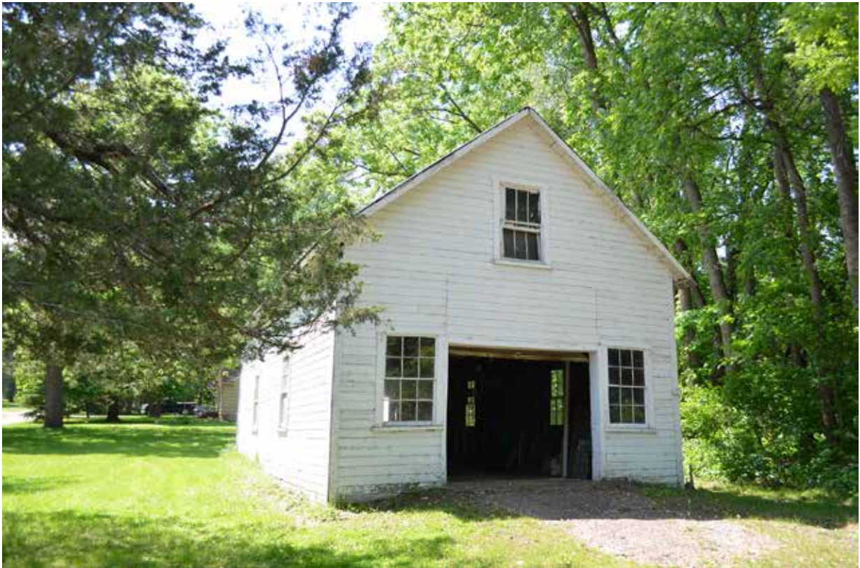
The front, east-facing elevation of the Emil Asp Blacksmith Shop on St. Croix Trail South. Note the original six-over-six double hung windows on the lower level and the three-over-three windows in the loft. Camera facing west, northwest.