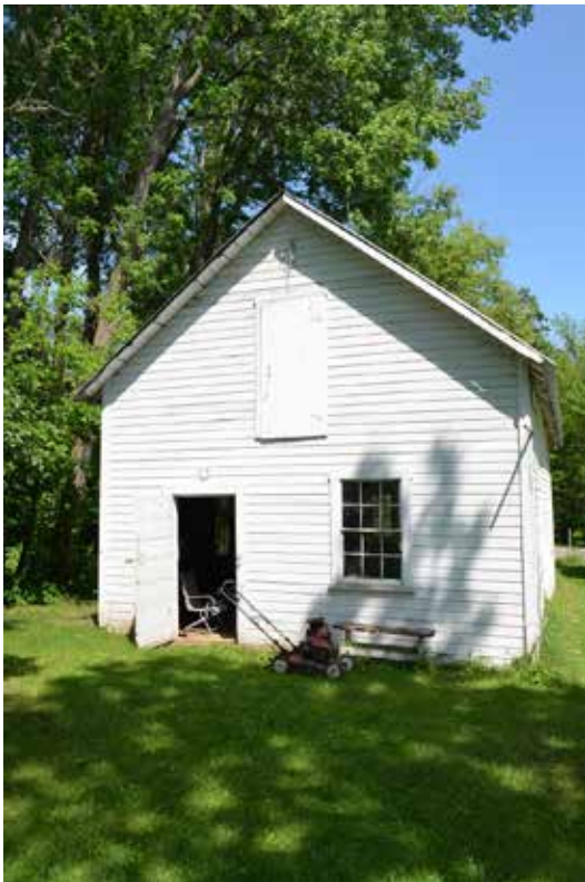
The back west-facing elevation of the Blacksmith Shop with its original doorway, six-over-six double-hung window and loft above. Camera facing east toward St. Croix Trail South.