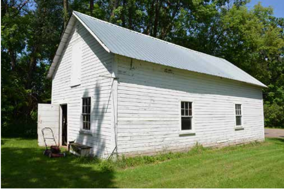
The west and south-facing elevations retain their window openings and display double-hung sash. Note that the lower sash on the south elevation have been replaced with a single pane of glass. Camera facing east, southeast toward St. Croix Trail South.