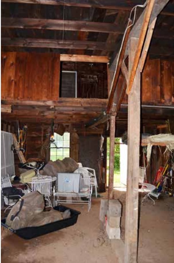
The interior wood floor was lost to wet rot and the interior now displays a dirt floor. The hayloft can be seen in the interior view looking to the west.