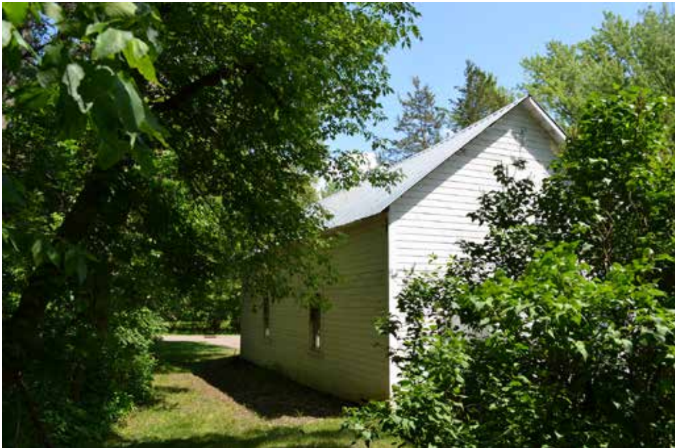
The north and west-facing elevations retain their window openings and display double-hung sash. Camera facing east, southeast toward St. Croix Trail South.