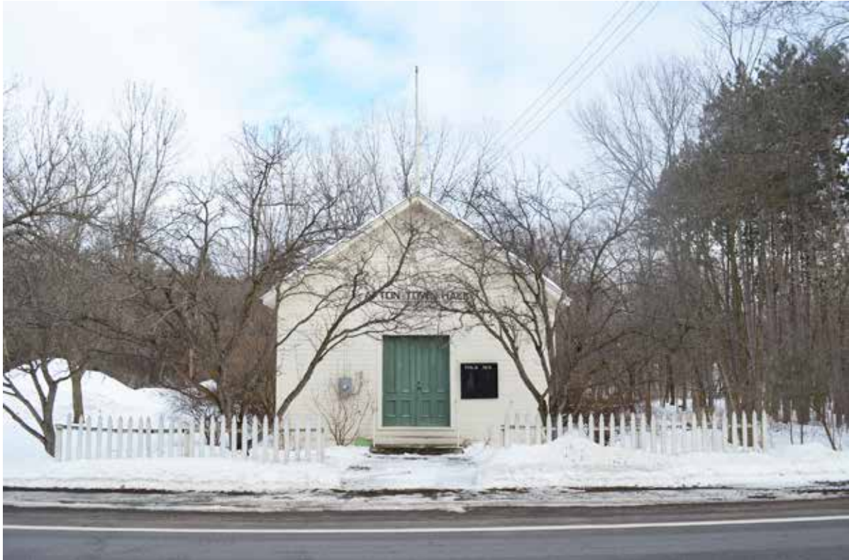
The Afton Township Hall built circa 1883 in Valley Creek retains most of its original exterior and interior architectural features. Camera facing east across Stagecoach Trail.