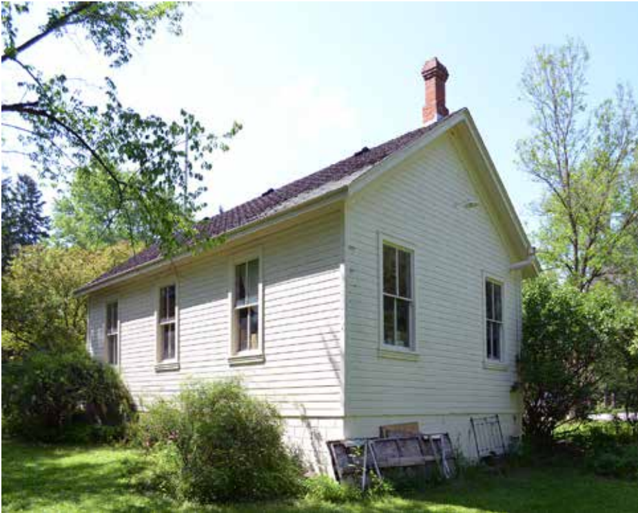
The south and east-facing elevations of the Hall display their original windows and the stove chimney.