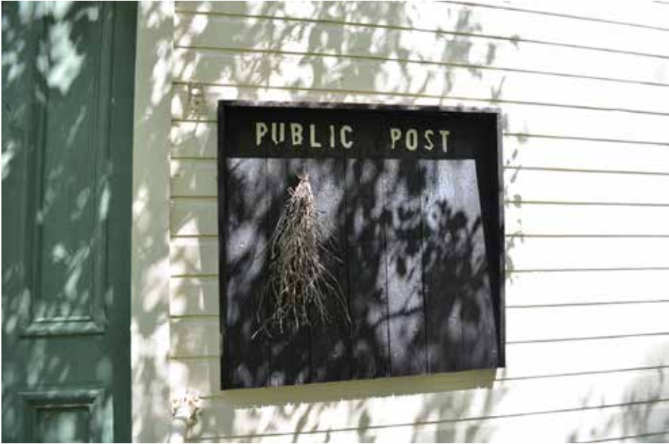
The original "PUBLIC POST" board remains to the right of the entry on the west-facing elevation.