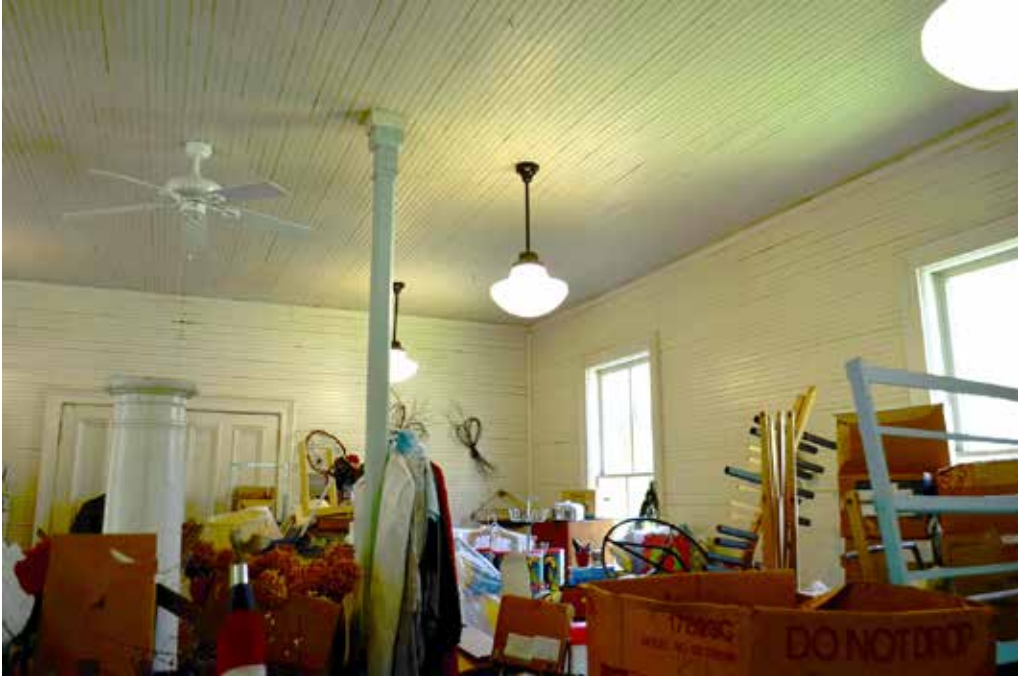
Interior view looking to the west.