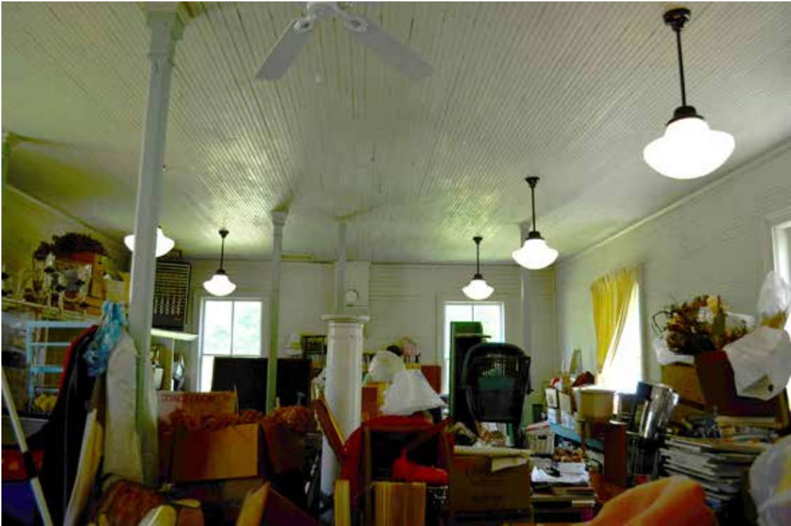
The interior walls and ceiling are sheathed in a beadboard finish. Camera looking to the east.