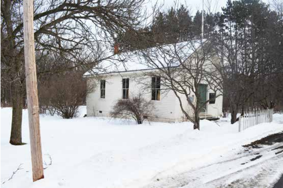
The Township Hall displays its original entry doors and its side elevation two-over-two double-hung windows. The only architectural feature that has been added since the hall's early construction is a 20 th century concrete block foundation.