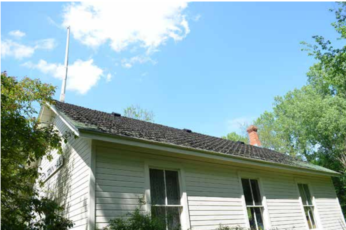
The peak of the front gable retains its original flagpole.