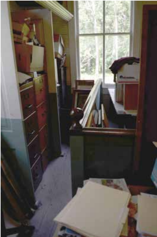
The Hall is currently being used for storage.. The edge of the stage (with finial) can be seen elevated a few steps above the floor. Also note the two-toned door that defines one of the north wall's voting stations.