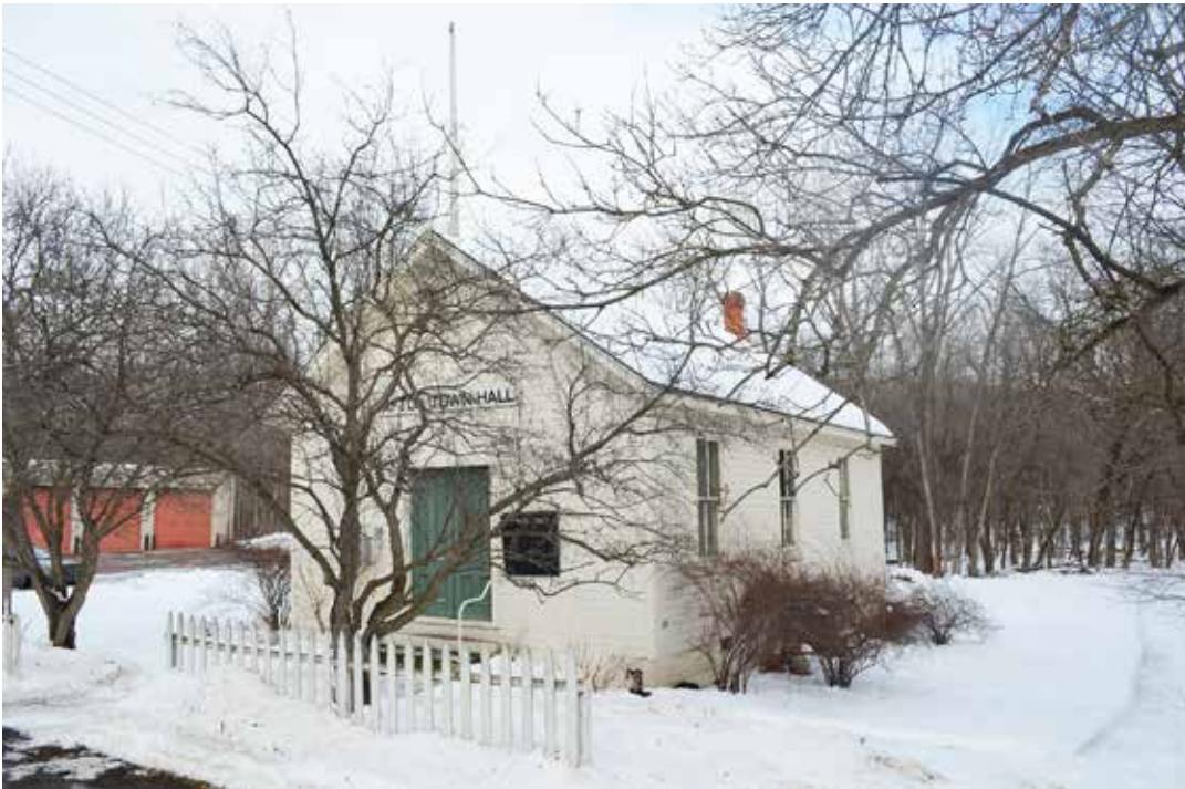
The Township Hall now shares its parcel with a City of Afton maintenance garage to the north.