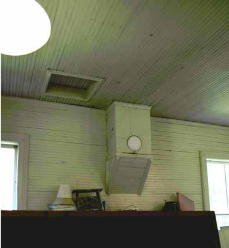
The brick chimney that vented the original stove sits on a platform on the east wall. .