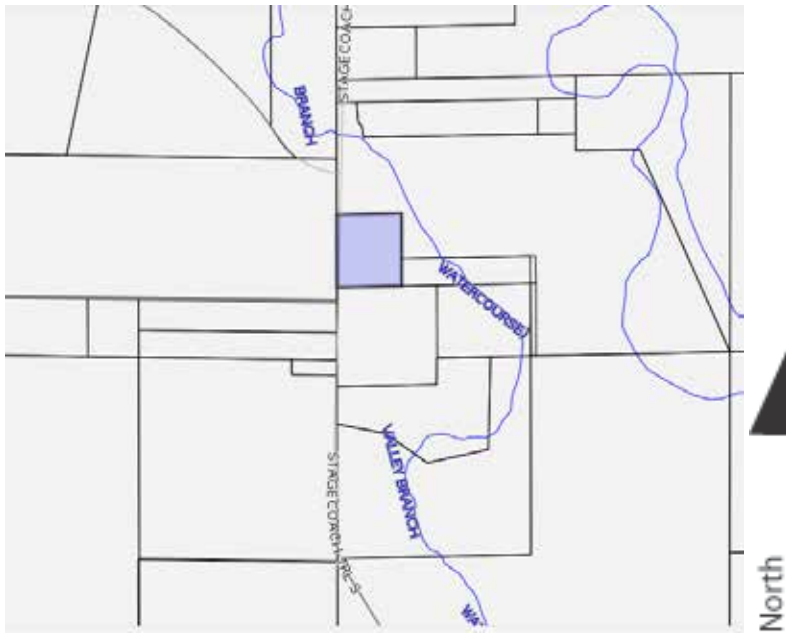
Parcel map for the Afton Township Hall on Stagecoach Trail South in the Valley Creek area. .