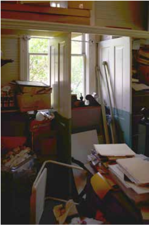
Voting stations divided by residential doors still remain along the northern wall of the interior.